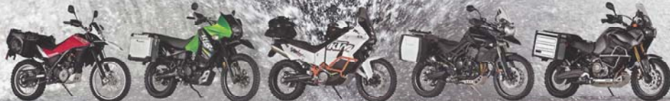
HUSQVARNA TR650 TERRA

ARMAGEDDON TOUR: WHAT WILL YOU RIDE TO THE END OF THE WORLD?